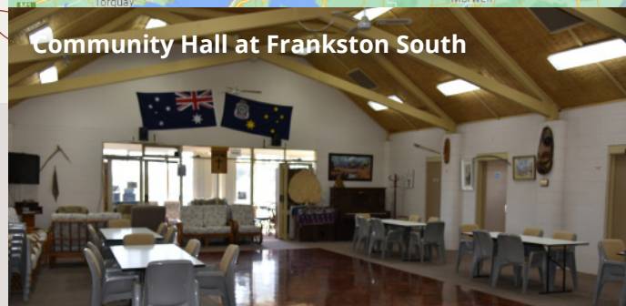
Community Hall at Frankston South