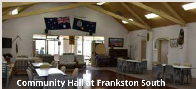
Community Hall at Frankston South