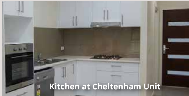
Kitchen at Cheltenham Unit